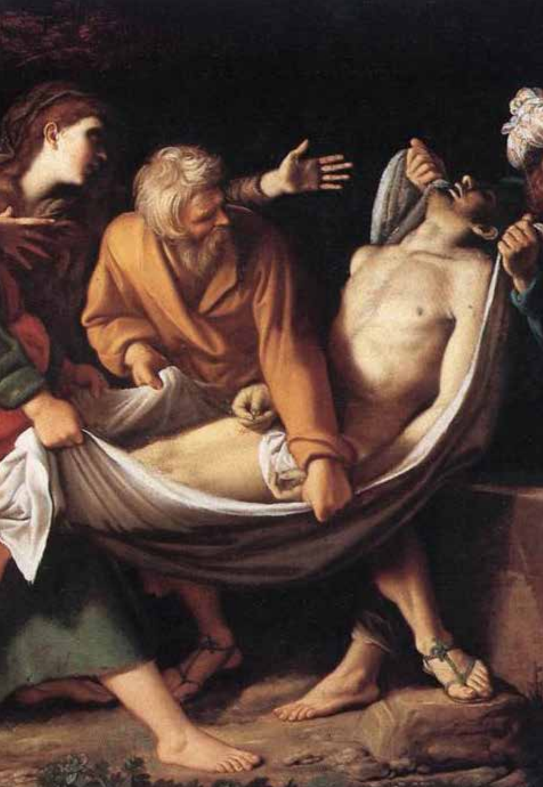
"The Entombment of Christ," by Sisto BADALOCCHIO, c. 1610