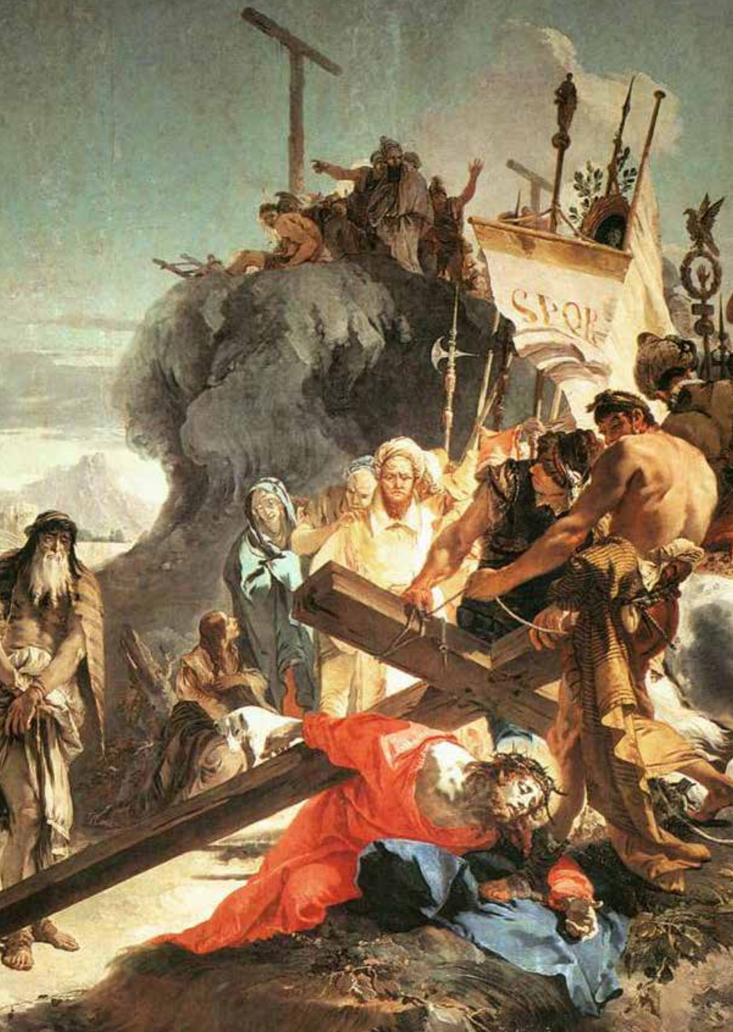
"Christ Carrying the Cross," by Giovanni Battista TIEPOLO, c. 1737