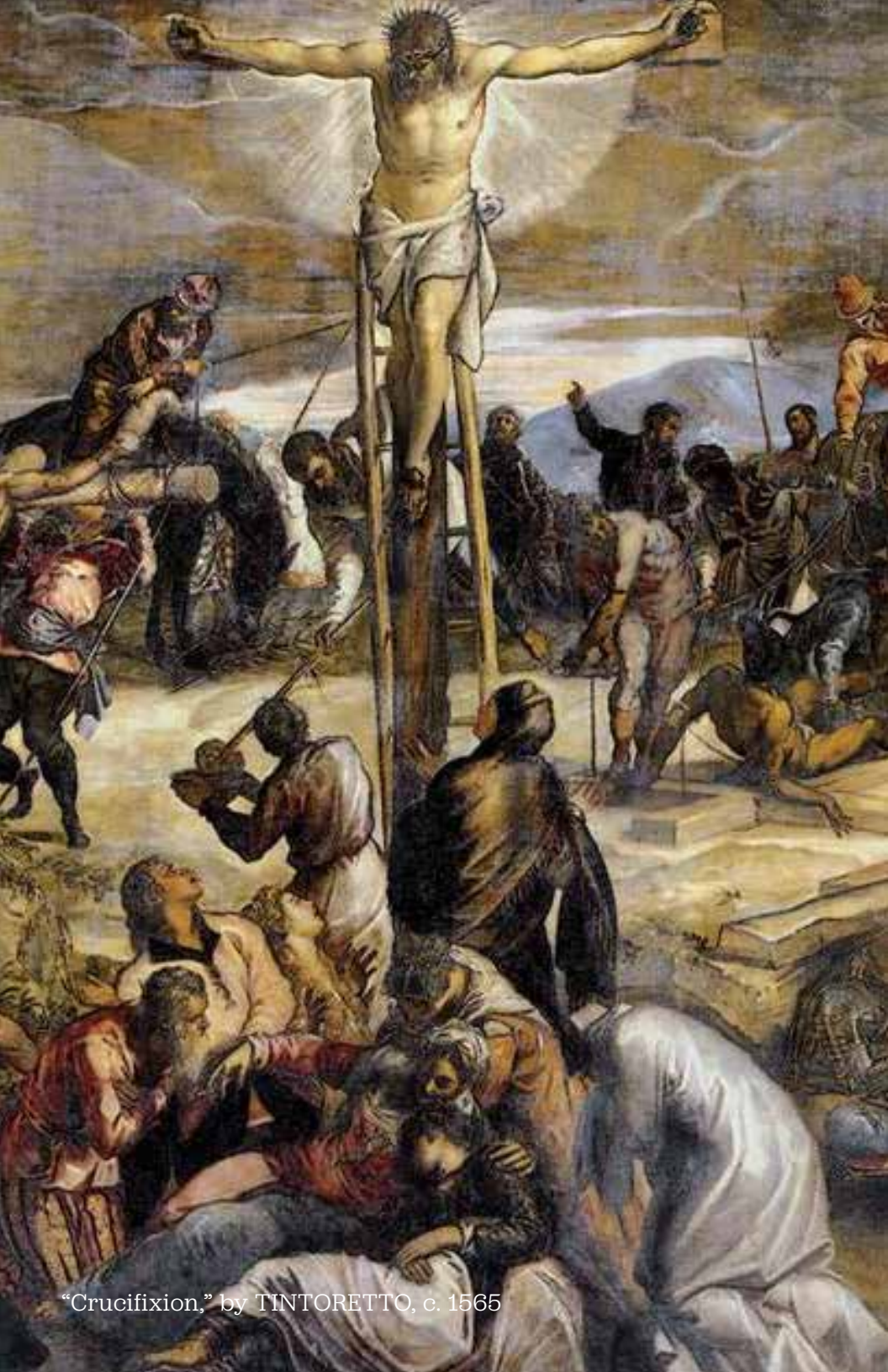
"Crucifixion," by TINTORETTO, c. 1565