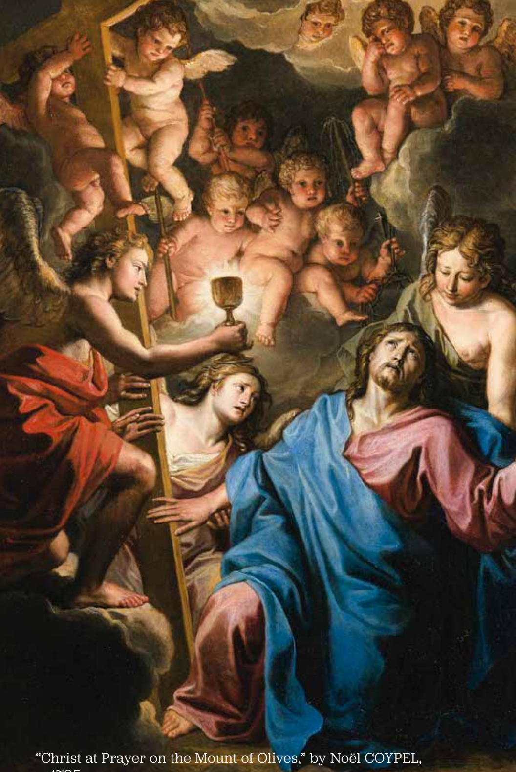
"Christ at Prayer on the Mount of Olives," by Noël COYPEL, c. 1705