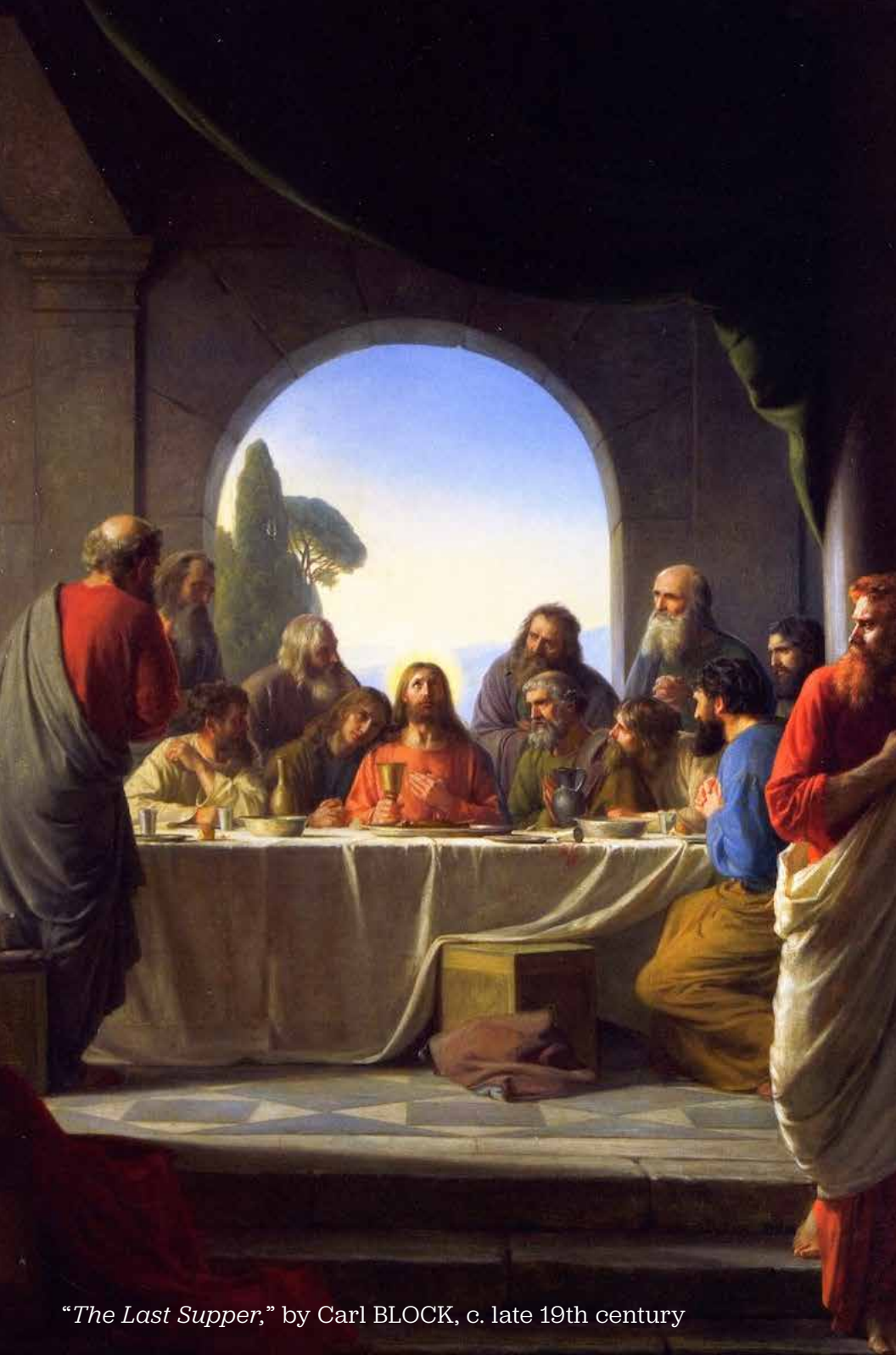
"The Last Supper," by Carl BLOCK, c. late 19th century