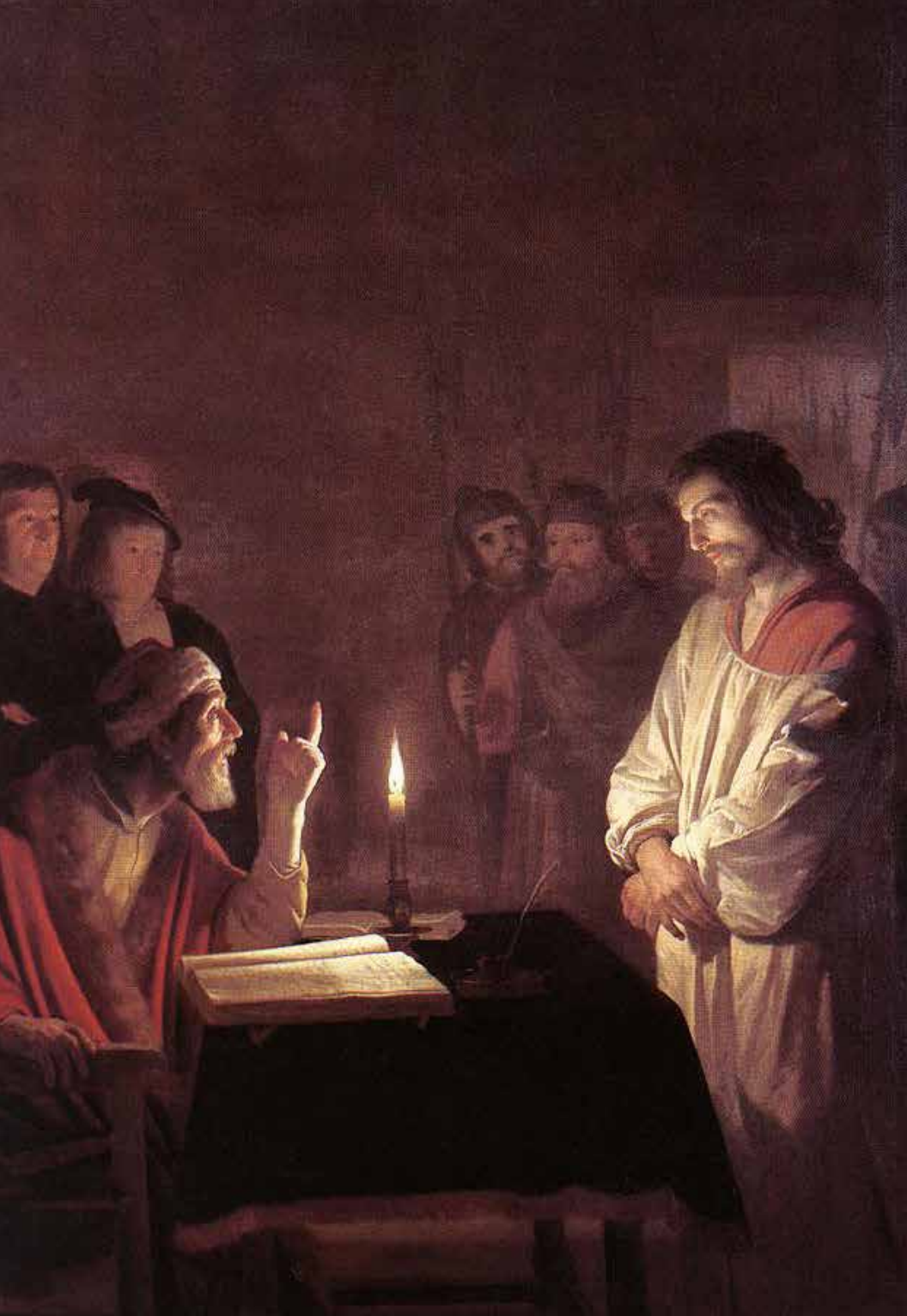
"Christ Before the High Priest," by Gerrit van HONTHORST, c. 1617